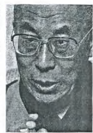
Private warning: the Dalai Lama

He has suggested that a good test of the qualifications of a matric master who is beyond attach-