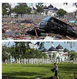
Then and now images, as the fifth anniversary approaches