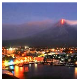
Thousands evacuated as villages threatened