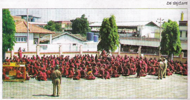
850ಕ್ಕೂ ಹೆಚ್ಚು ಲಾಮಾಗಳು ದೇವಾ ಪಿರಿಯಾಪಟ್ಟಣದ ಬೈಲುಕುಪ್ಪೆ ಟಿಬೆಟಿಯನ್ ಕ್ಯಾಂಪಿನ ಸೆರಲಾಚಿ ದೇವಾಲಯದಲ್ಲಿನಡೆದ ಲಯದೆ ಬಳಗೆ ಪ್ರಾರ್ಥನೆ ನಡೆಸಿದರು. ಹೊಸವರ್ಷಾಟರಣೆಯ ಪೂಜೆಯಲ್ಲಿ ಪೌವ್ರುಖಾಸ್ ಪಂಗಡದವರಿಗೆ ದೇವಾಲಯ ಪ್ರವೇಶ ನಿಷೇಧಿಸಿದ ಆದರೆ ಬಹಿಷ್ಯತ ಪೌಮ್ರಖಾನ್ ಹಿನ್ನೆಲೆಯಲ್ಲಿ ಪ್ರಾರ್ಥನೆ ಸಲ್ಲಿಸಿದರು.

ಸರಾಮೆ ಮತ್ತು ಸರಾಜಿ ಧರ್ಮಕಾಲಿ ಪಂಗಡವನ್ನು ಸಾಮಾಜಿಕವಾಗಿ ಗಳಂದ ಪೌವ್ರು ಖಾನ್ ಪಂಗಡ ಬಿಹಿಷ್ಠರಿಸಿದ್ದಾರೆ. ಅಲ್ಲಸಂಬ್ಯಾತರಾಗಿ ದವರನ್ನು ಬಹಿಷ್ಠಾರ ಹಾಕಿದಂತಾಗಿದೆ. ಹೆಸರು ಸುತ್ತಿ ಹಕ್ಕುಗಳಗಾಗಿ